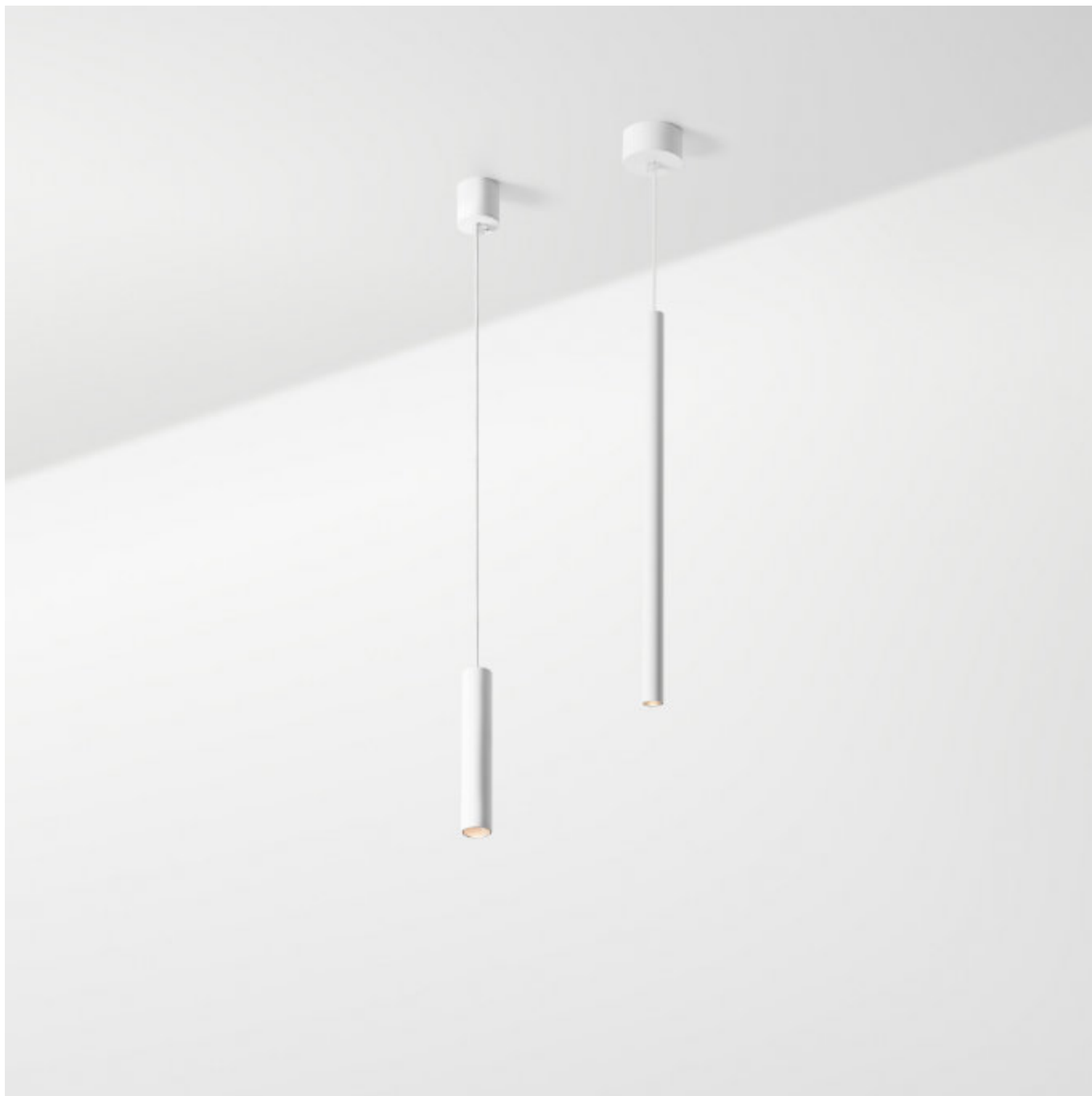
stik35.200 ZW / 25.500 ZW