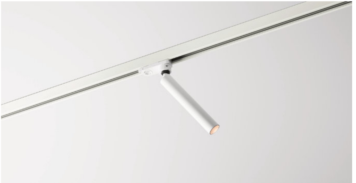
stik pure 35 ad 3F