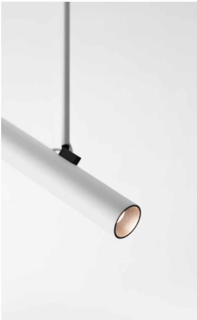
stik 35.1ad 3F