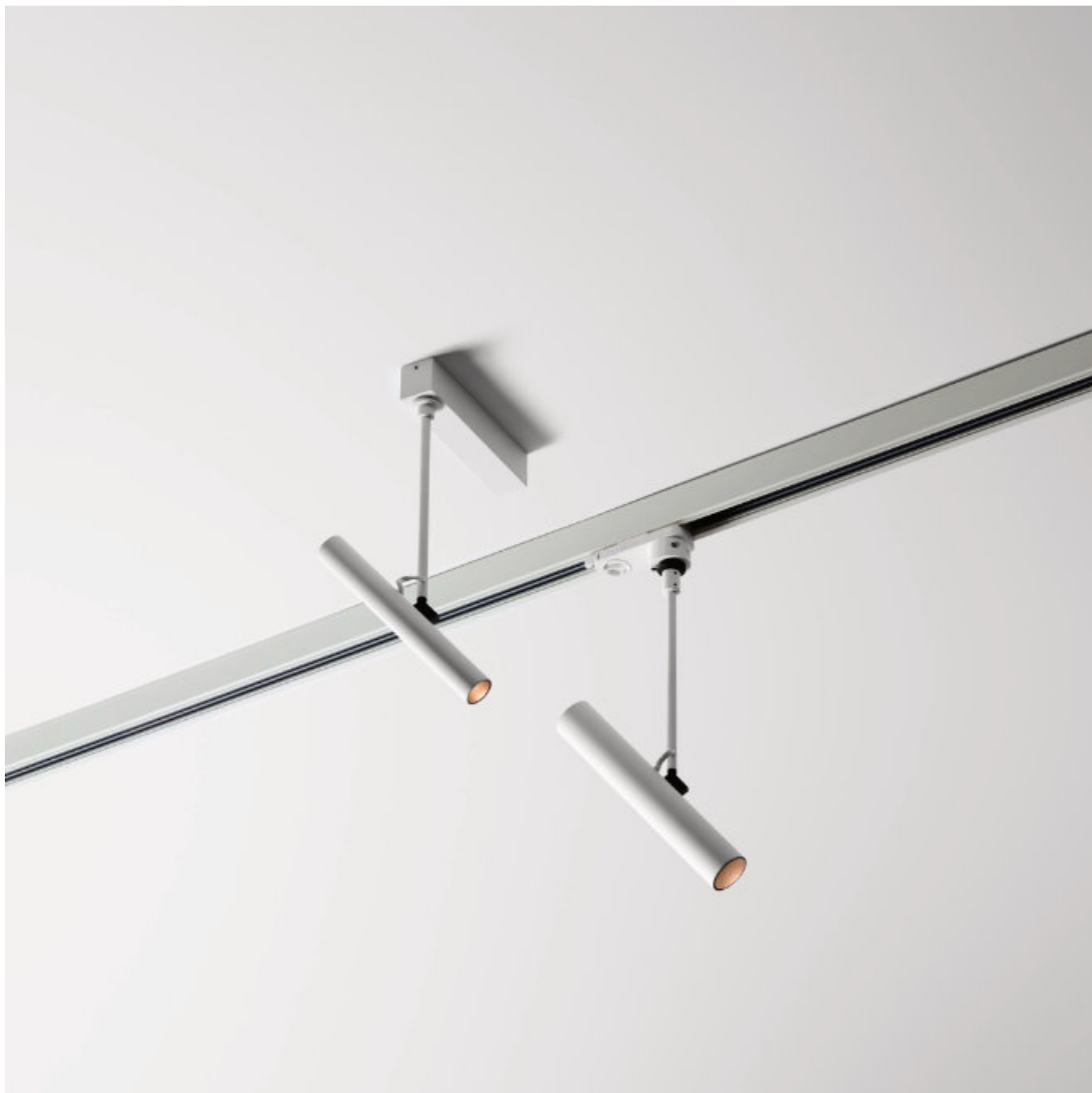
stik 25.1NT / 35.1ad 3F