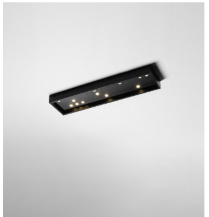
pixel 16.64 NT