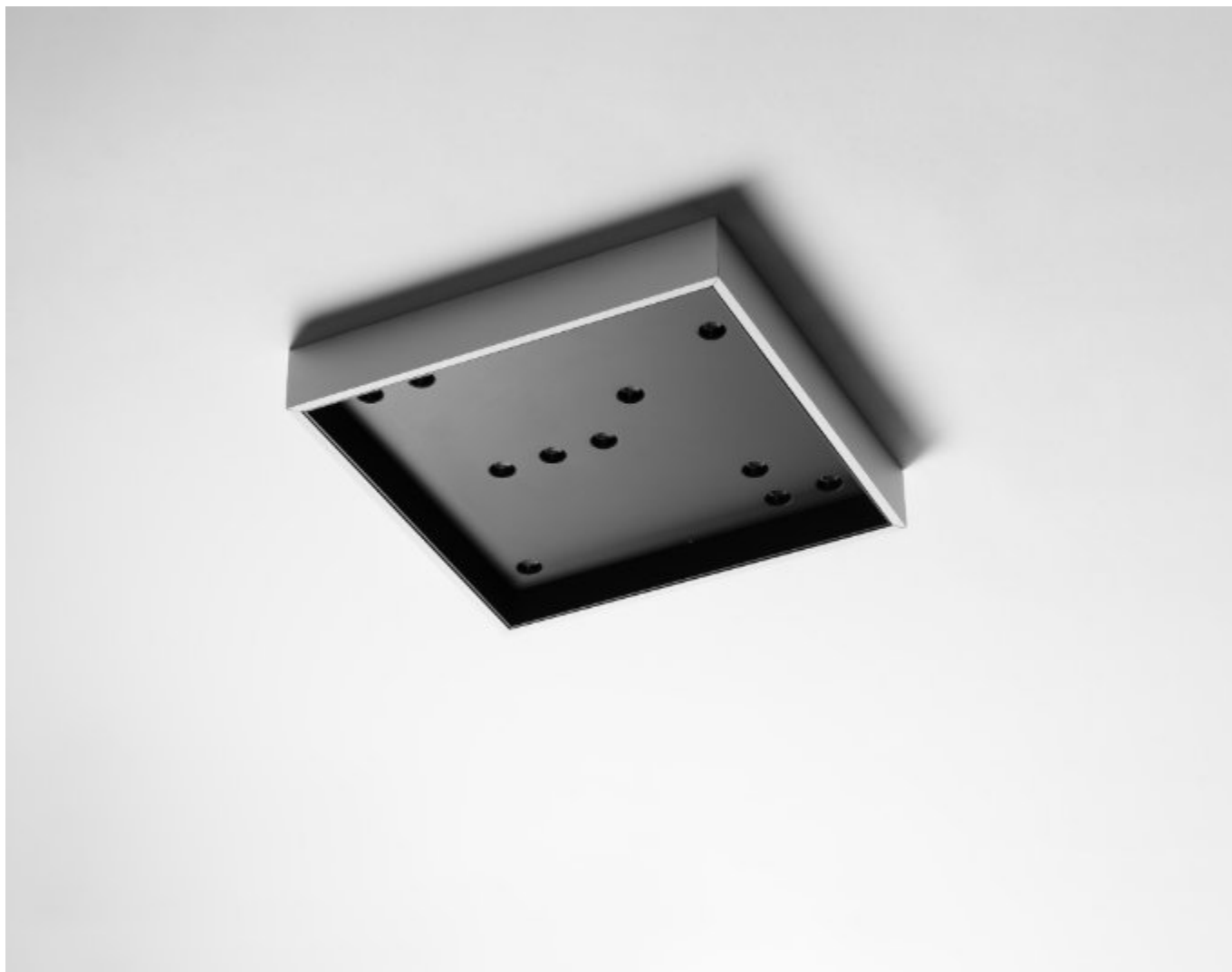
pixel 32.32 NT