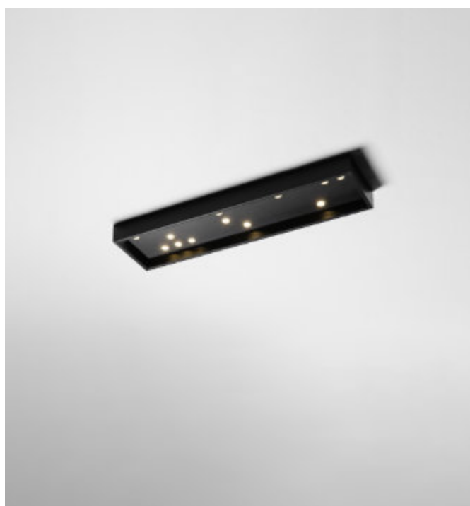
pixel 16.64 NT