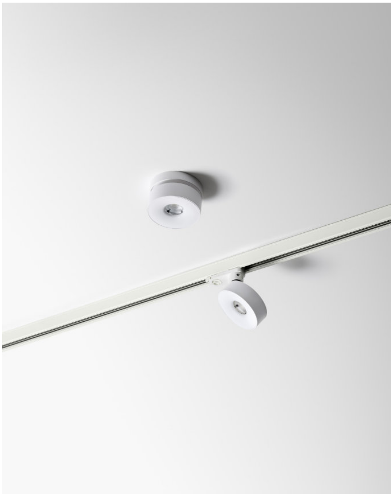
mono move NT / ad 3F