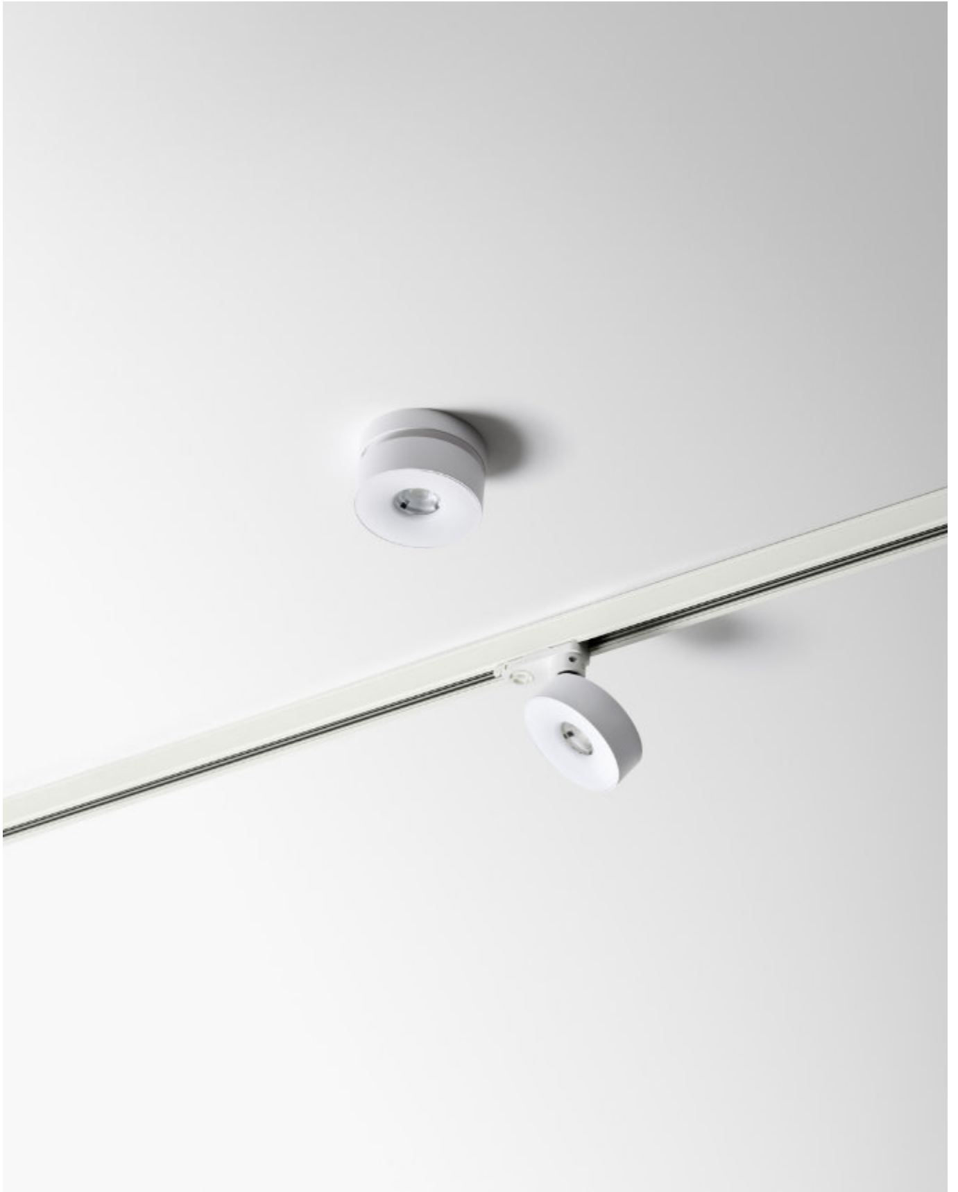
mono move NT / ad 3F