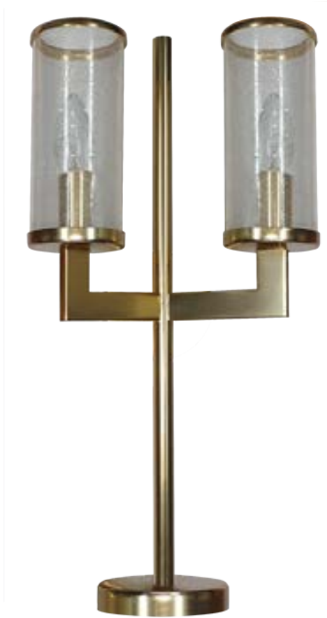
CRACKED GLASS 1 LIGHT PENDANT LAMP20 80017