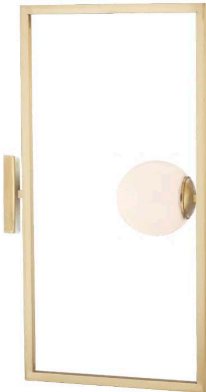
WINDOW /W 50003