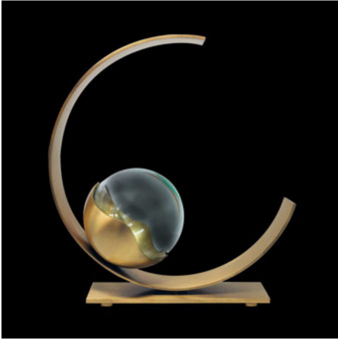
WANING /T 50001