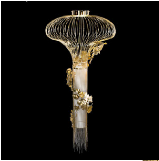
LEAVES ONION HE-016 Pendant Lamp