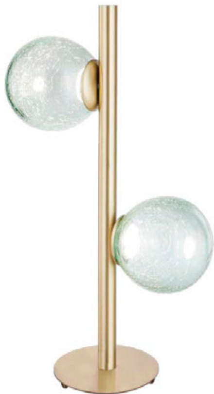
CRAQUELE /T 50004